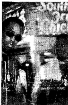
1. Puff Daddy 691